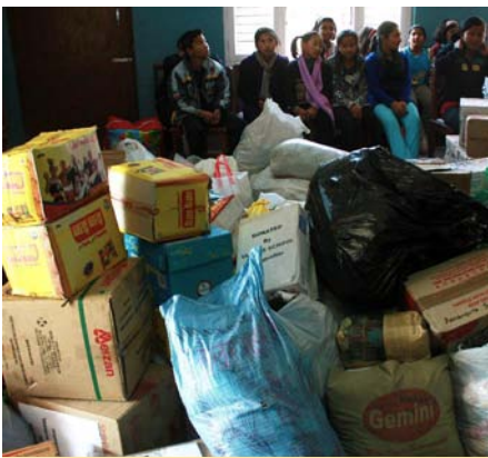
Donation of food and clothes to local school

On World Animal Day, Monday, October 4, 2010 children participated in a Walkathon organized by Animal Nepal. Children from Grades 6-9 participated in a 6 kilometer walk from Lalitpur Municipality Offices to GAA Hall in Thamel. The walkathon was intended to raise consciousness of participants and make the general public aware of the cause of animal rights. The students made and displayed placards illustrated and written in Nepali on one side and English on the other. Each student participating was asked to find sponsors to pledge their walk. A total of Rs. 67,905 was collected by Ullens students. Many teachers, Ullens School transport staff as well as support staff also participated in the walkathon. The amount collected by Ullens School students was handed