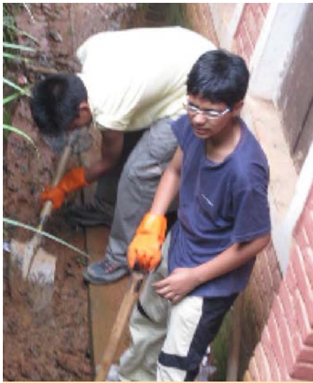
Service Learning-Busy cleaning up the service site

activities have been carried out towards meeting the objectives set by the Service Learning Program.