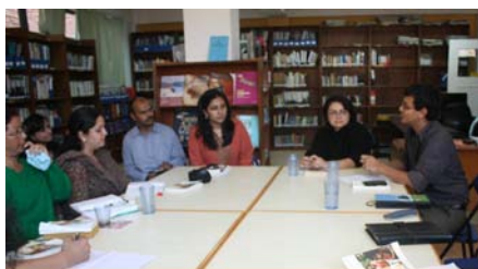
Interaction with Manjushree Thapa

Noted author of books like The Tutor of History , Forget Kathmandu , Tilled Earth etc. Ms. Manjushree Thapa , visited Ullens School on Sunday, October 24, 2010. The interaction program was part of the Ullens School Lecture Series events and developed in association with Quixote's Cove - a literary programs managing outfit and a bookstore based in Jawalakhel. The interaction between Ms. Manjushree Thapa and teachers and