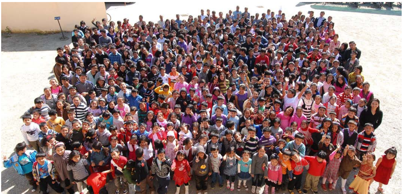
All school photo coordinated by students of the Journalism Club to mark the 5th School Day on 11 November 2010

Ullens School celebrated its fifth Annual School Day amidst a special function in the school auditorium on Thursday, 11th November 2010.