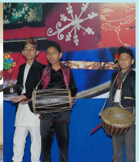
Songs for unity in diversity and ethnic rhythms being performed by students