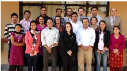
IB Admin and Faculty Team

In response to high demand for comprehensive sciences offerings, Ullens School IB Diploma Programme now provides Standard and Higher level Biology classes. Similarly, in the group 6 category, the Ullens IBDP offers Theatre at the Standard as well as the Higher level.