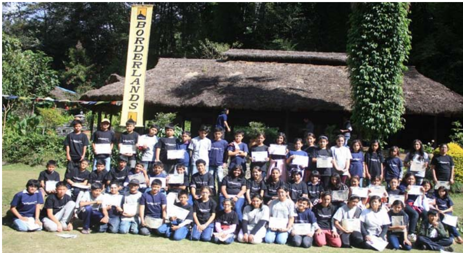
Group photo at Boaderlands

other, being economical with resources, and the love of nature in the process.