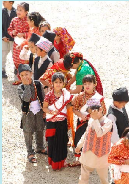
Children dress up in traditional costumes