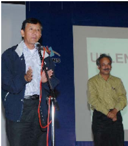
Felicitations by the SMC

Students, faculty, staff and distinguished members of the Board of Trustees, School Management Committee, and parents were in attendance as the progress made by the school in fostering a top quality progressive learning within a short span of five years were highlighted.