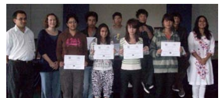
Certificates for participants of Critical Documentary Filmmaking Workshop, 2009