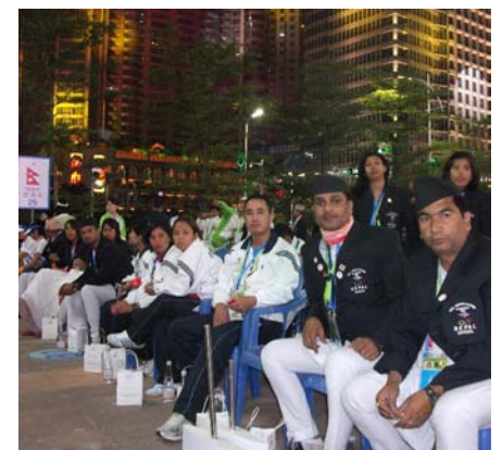
CAS Coordinator in China with Nepali TT Team