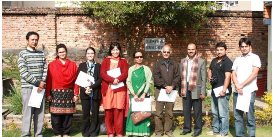
ICIMOD's Herbal Garden Project monitoring team visits Ullens School

The event culminated with class, and group photo sessions.