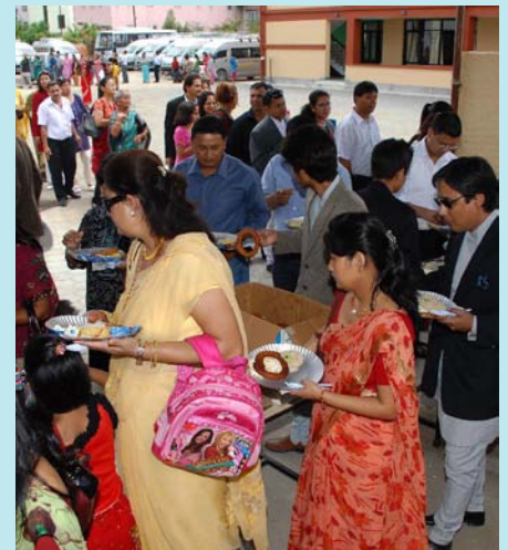
Ethnic food delights

ATP also took the lead in organizing one of the biggest days in Ullens School calendar - the Diversity Day. All of the food management was handled by the Action Team for Partnership with active participation of its members and that of other parents in making sure the big turnout of people got a taste of the good food.