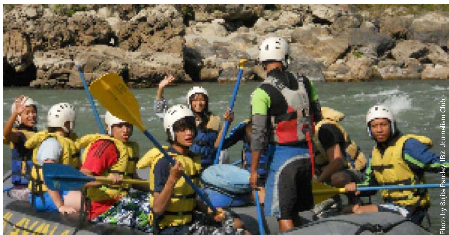
Ready for the rapids - IB2 students on the Trisuli River

In addition to the one of each of the above categories, Ullens School IBDP students must attend the Sunday Outdoor Leadership program which trains them in life skills and outdoor activities like Orienteering, First Aid Training, Cooking, Camping, Hiking etc. So far the first year students have already been Rock