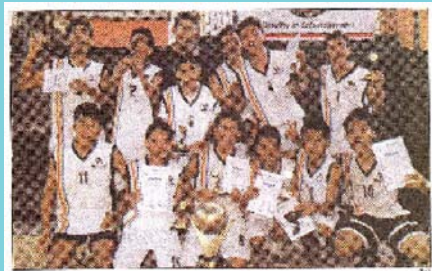
Players and coach of Ullens school celebrate after winning the senior boys title of the Wilson Hoops 10th Inter-school Basketball Tournament in Kathmandu on Saturday.