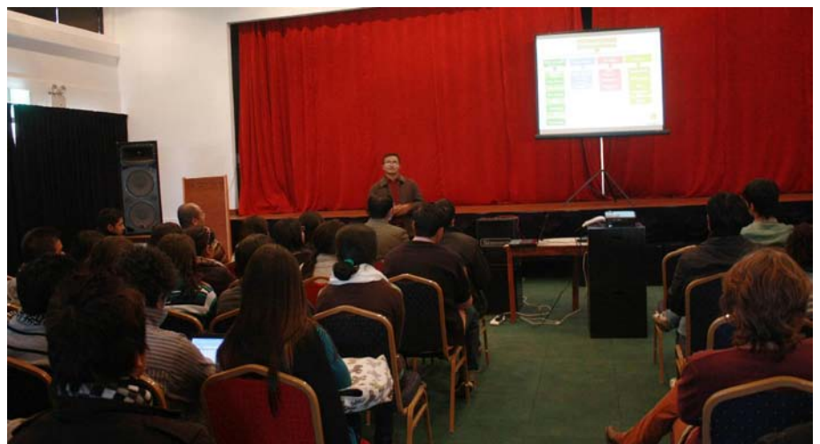
Microsoft's awareness session for Ullens School students, faculty and admin