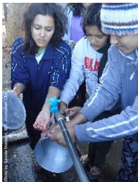
Doing your own chores

In Creativity, Journalism for News and Yearbook, Theatre, Salsa, B-Boying, Mural Arts, Music and Cooking are offered. In Service, helping at the B & B Hospital, MSPN, Center for Cerebral Palsy, Old Age Homes, In-school support for Grade 1